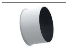
Full Anti-Glare Shield