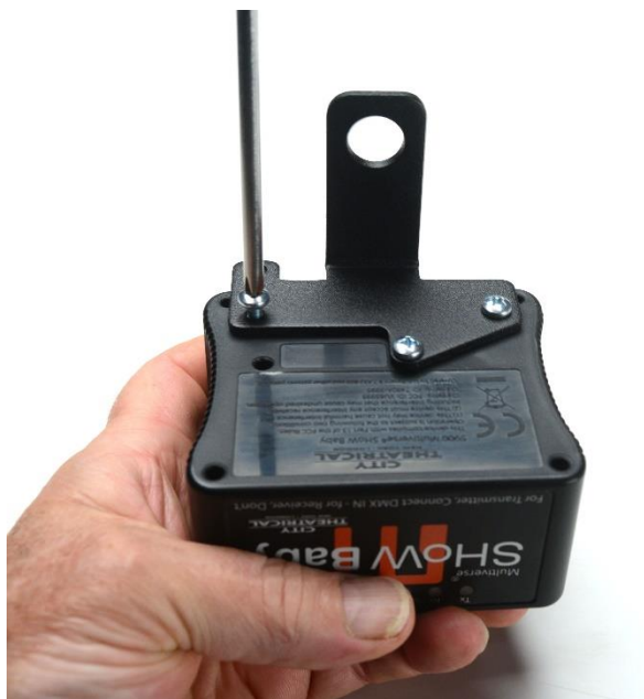
Figure 2: Attaching the Mounting Bracket

Mount the Bracket on the Multiverse SHoW Baby using the three provided 8-32 x ½" pan head Philips screws.